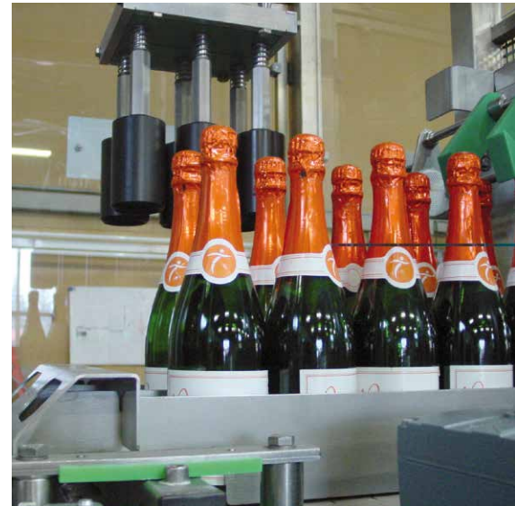
Packer VARI-single-head for sparkling wine bottles