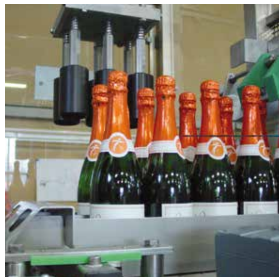
Packer VARI-single-head for sparkling wine bottles