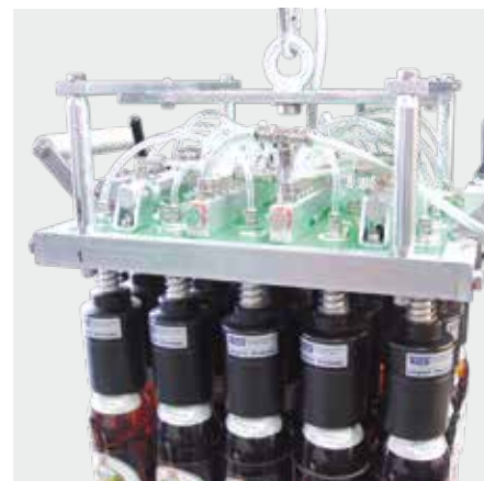
20-piece manual packing head for 0.5 l Euro bottles