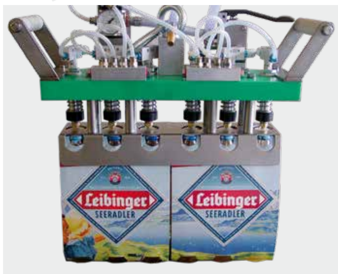
Special manual packing head to move two six-pack packages into pin-partitioned crates